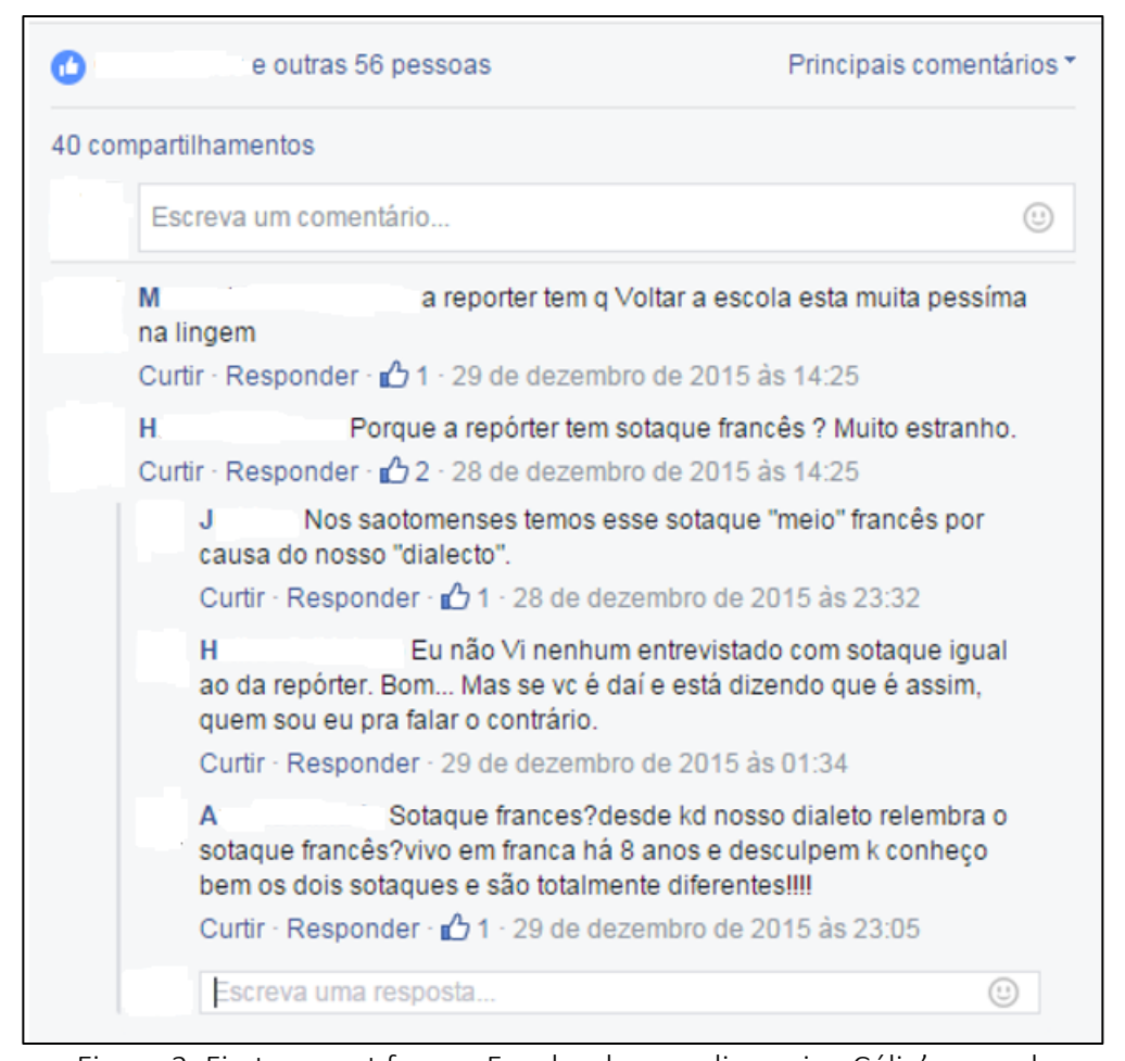
Figure 2. First excerpt from a Facebook page discussing Célia's speech